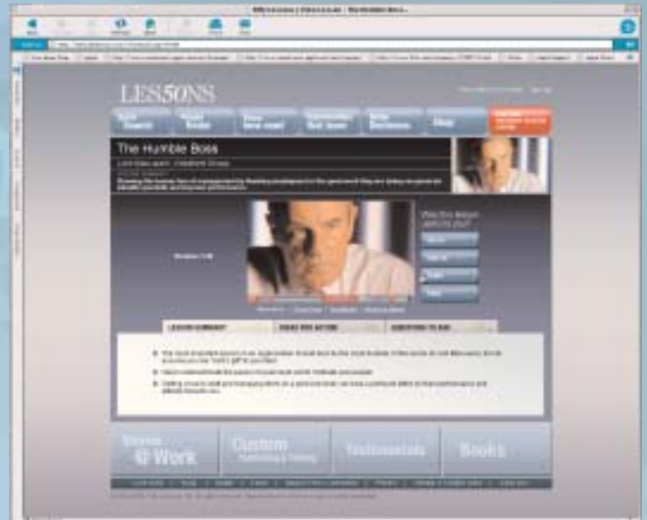
Fifty Lessons website page showing a video lesson from Lord MacLaurin, Vodafone.

Fifty Lessons represents an invaluable resource for organisations that want to encourage behavioural change, for academics and consultants that want teaching material that is practical and engaging, and for individuals seeking guidance or inspiration in their own career. Powerful, engaging content with actionable suggestions for building on the lessons learnt and sharing thoughts and successes.